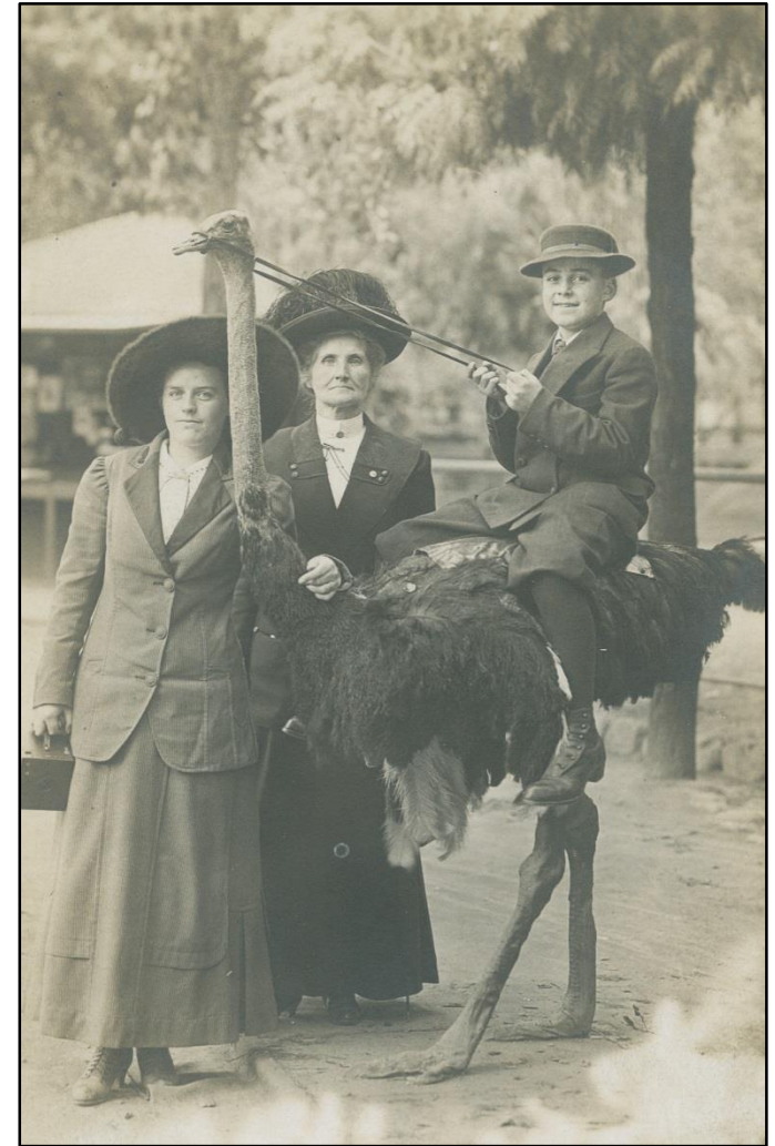
Postcard of family at Cawston Ostrich Farm, Pasadena California, ca. 1900 (2011-024-014)