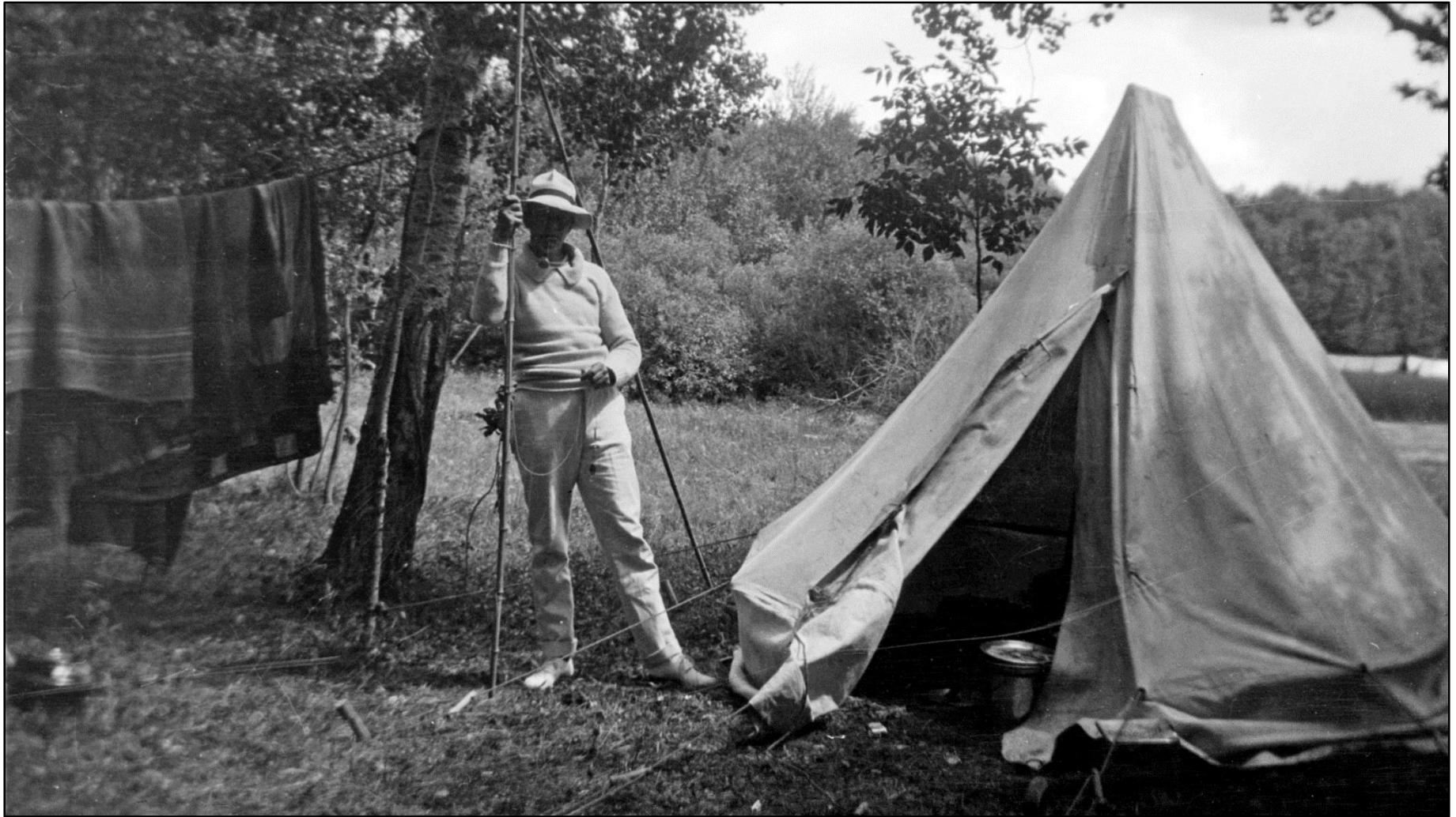
Camping at Cordova Bay beach, 1 July 1905 (2010-050-244)