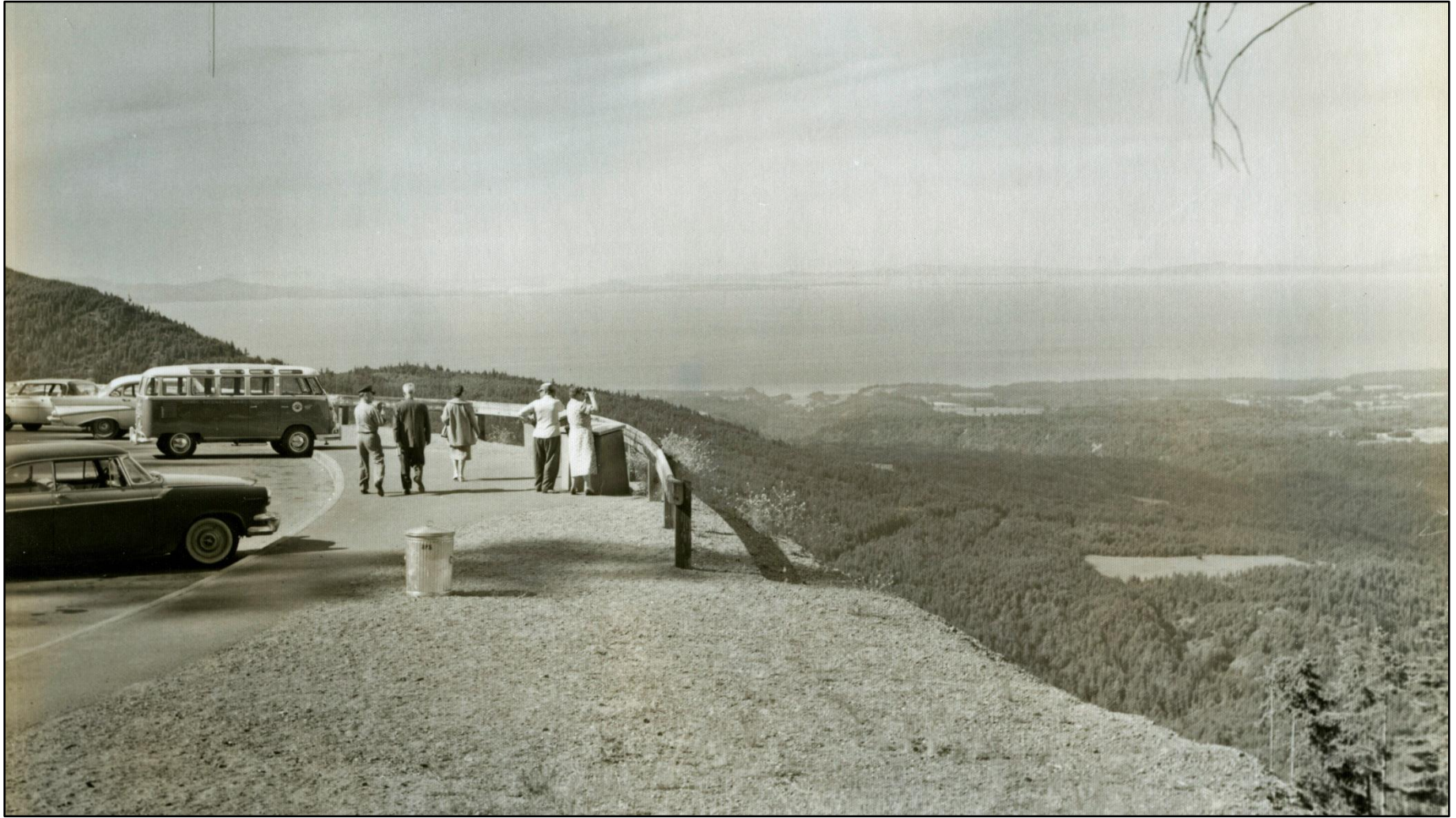
Viewpoint at Hurricane Ridge, Olympic National Park, Washington State, 1950s.