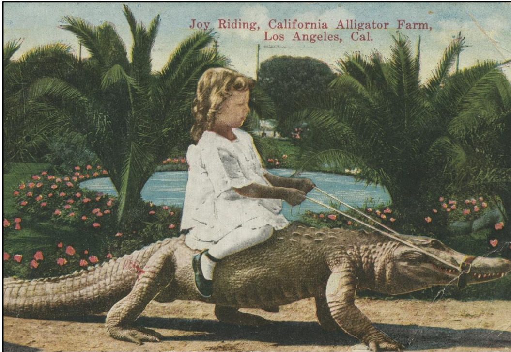
Postcard from California Alligator Farm, Los Angeles, California, ca. 1920 (2018-030-196)