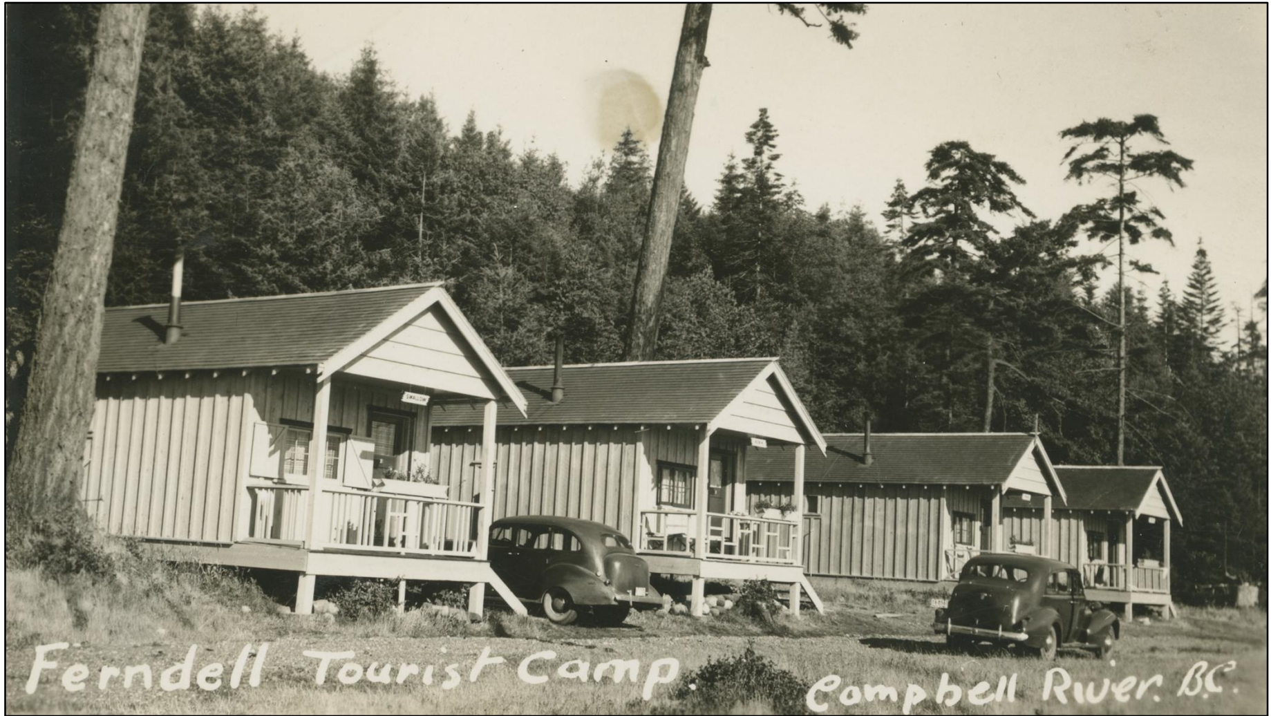
Postcard of Ferndell Tourist Camp, Campbell River, BC (2018-030-247)