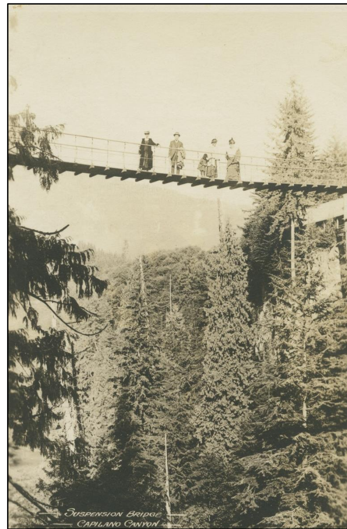
Postcard of the Suspension Bridge in Capilano Canyon, North Vancouver, BC ca. 1920s (2019-017-109)