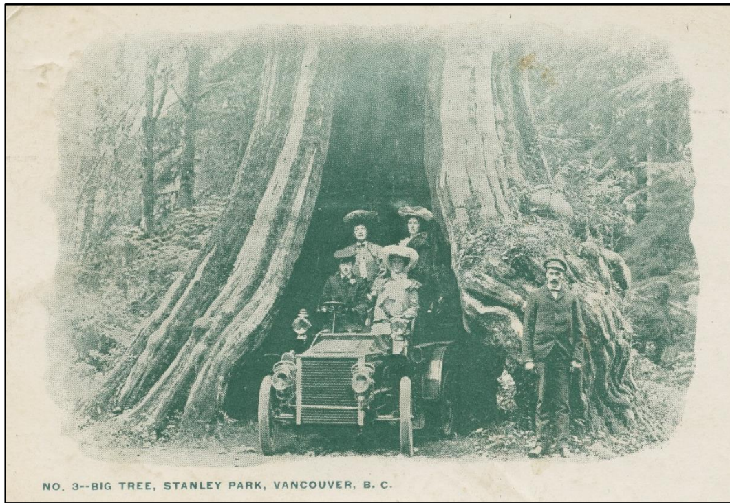
Postcard of the "big tree" in Stanley Park, Vancouver, BC, 1910 (2017-014-002)