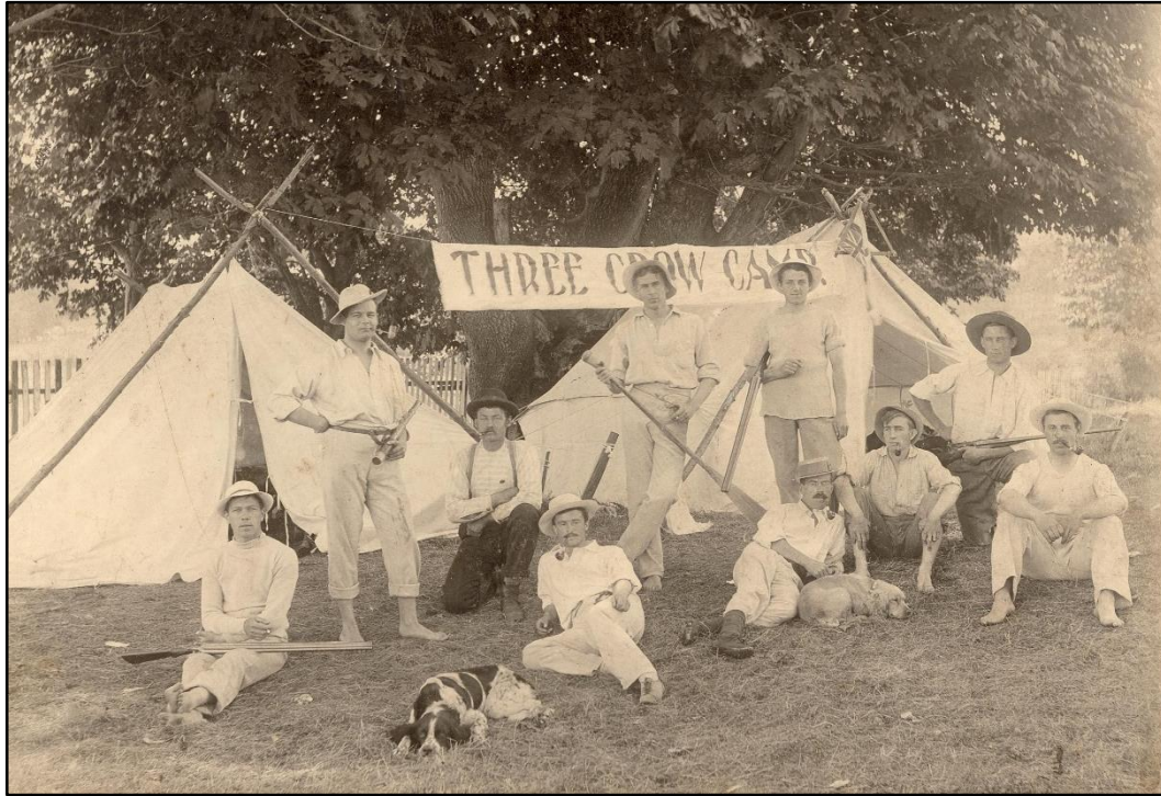
Three Crow Camp, Cadboro Bay, early 1900s (1981-019-028)