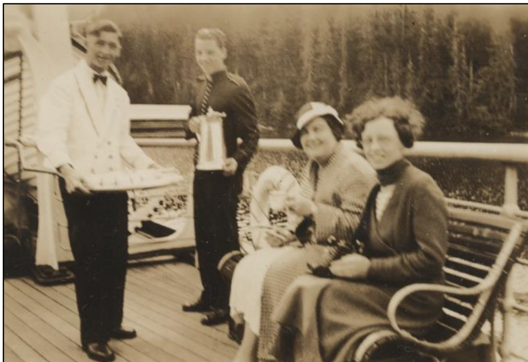
Passengers being served beef tea on the ferry to Portland, 1932 (2007-195-005)