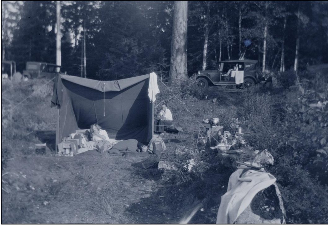
Gray family campsite, ca. 1920s (2007-053-029)